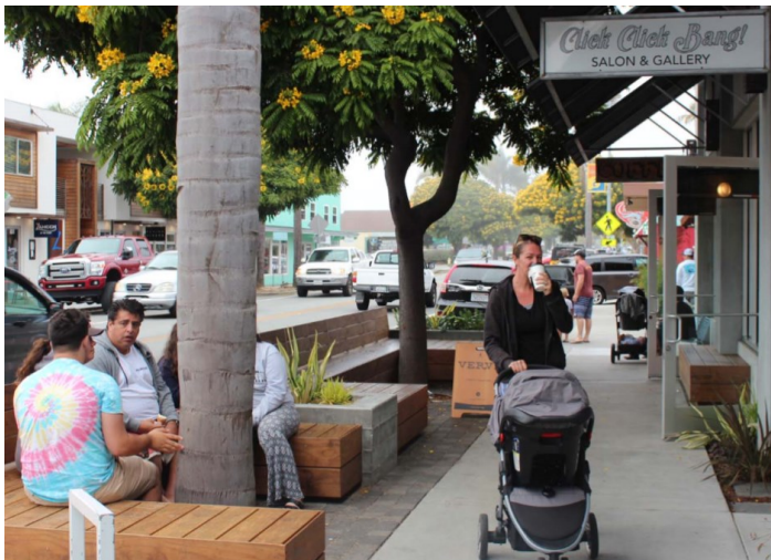
Outdoor seating on lower 41st Ave.