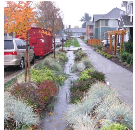
Bioswale and street trees.

For individual buildings and sites, design policies, guidelines and regulations support “green building” features such as solar energy systems, rainwater harvesting, and recycled and non-toxic building materials to conserve energy, water, and other natural resources and support a healthy indoor and outdoor environment. Sites are designed to preserve trees and natural site features, minimize off-site stormwater runoff, and incorporate native plants in landscapes to support local wildlife. These policies are aligned with the County’s Climate Action Strategy .