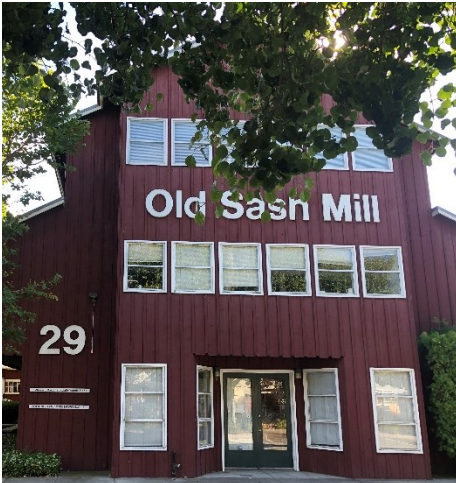
Multi-use Santa Cruz Sash Mill.

Small businesses are encouraged to grow in incubators, coworking spaces, and satellite offices. Broadband development is planned to accommodate traditional office growth as well as telecommuting. Home-based businesses that are compatible with residential neighborhoods serve to provide economic stability for property owners while adding to neighborhood land use diversity.