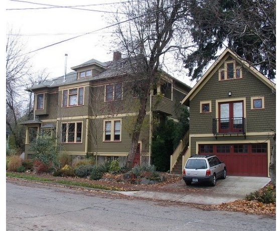
ADU over a garage provides infill development in an existing neighborhood.

The Sustainability Update promotes housing types such as accessory dwelling units (ADUs), small lot single family homes, dwelling groups, duplex/triplex/quadplexes, townhomes, and small apartment buildings, all of which can work well as “infill” development (new development within existing developed neighborhoods). These housing types are referred to as the “missing middle” because they have densities between those of single-family homes and apartment buildings. Infill development in single family neighborhoods adds population density to support a wider range of neighborhood businesses. Design guidelines will ensure that infill development is proportional in scale and size to the surrounding neighborhood.