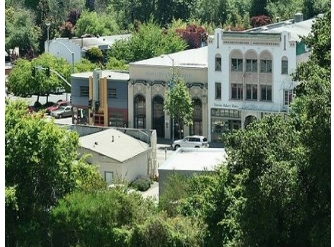
Soquel Village.

According to the U.S. Census, twice as many workers commute out of the County as commute in, and commute times are increasing. Higher-income residents tend to work over the hill, and there are few job opportunities within the County for these residents. On the flip side, workers in existing lower-wage jobs in Santa Cruz County are finding it more and more difficult to afford to live here. To improve the jobs/housing balance, the County is planning to accommodate strategic job growth in industries such as health care and technology, while simultaneously enabling more housing options for workers in existing industries such as agriculture and tourism.